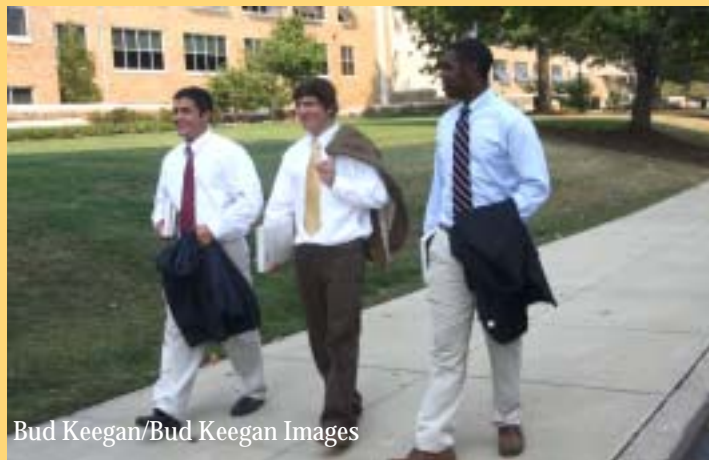
Bud Keegan/Bud Keegan Images