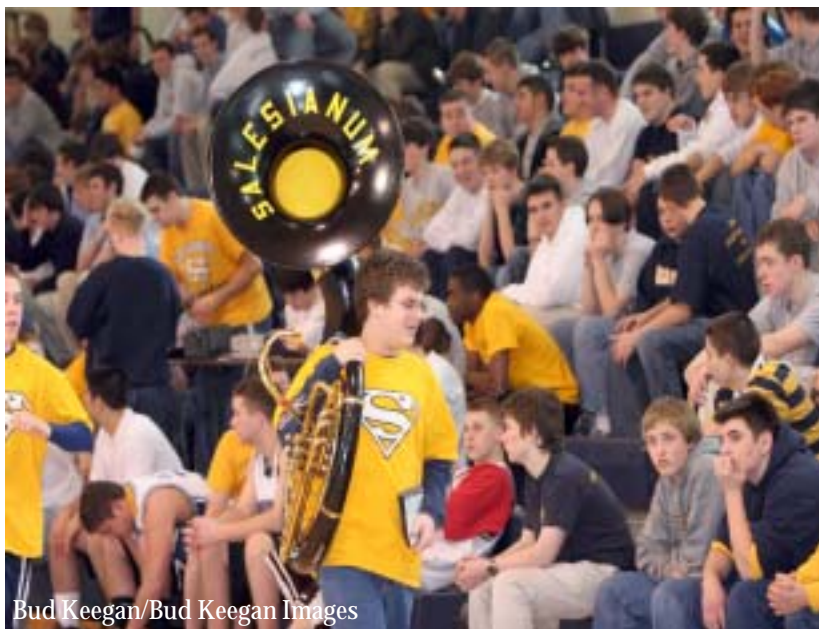
Bud Keegan/Bud Keegan Images